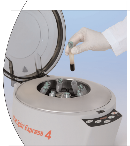
Gel tubes are separated in just 3 minutes